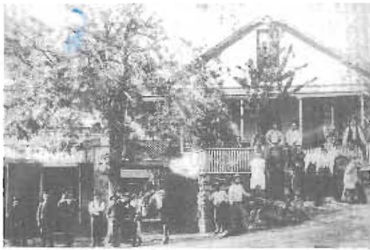
FIGURE 7 The Costa home in Calaveritas, Calaveras County, ca. 1890.