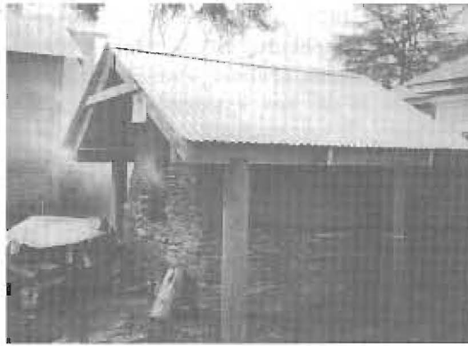
FIGURE 9. The reconstructed Ratto oven, behind the Calaveras County Historical Society Museum in San Andreas; photographed in 1995.