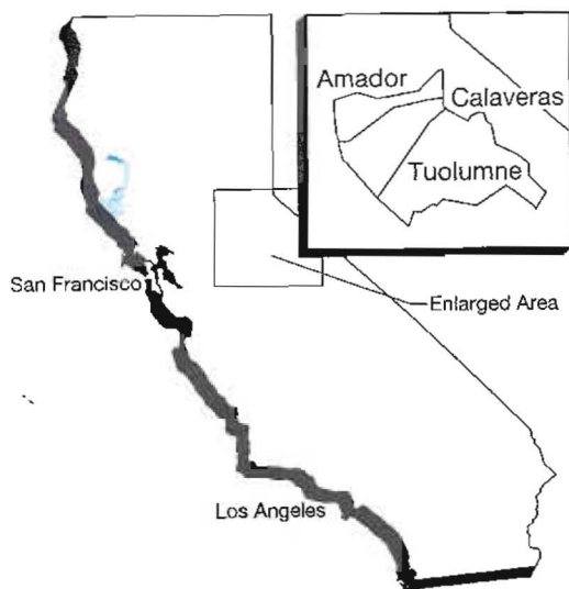
FIGURE 1. Location of oven study, in the foothills of the Sierra Nevada.

I have been reporting on the bread-baking ovens of the California Mother Lode (Figure 1),