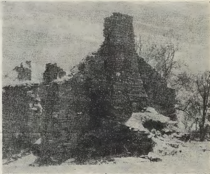
STONE HOUSES —These are the best preserved of the rock buildings at "Lost City" and are sometimes referred to as the "Chalet."

Finally, the name Lost City should be discussed.